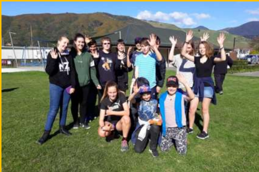
The annual combined Leo get together.