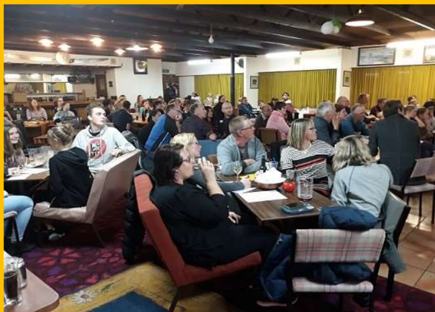
Quiz night 2018- did we get that one right?

The amount raised for this year's charities – a community defibrillator for Rai and subsidising the cost of the school camp for all pupils was $940 with proceeds being divided equally between the two charities.