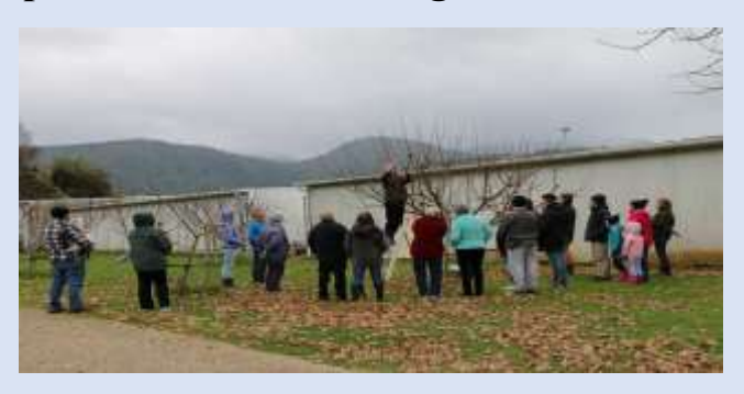
Alan demonstrates the technique

Then 23<sup>rd</sup> June arrived- and it is pouring with rain! However, 20 people turned up and Alan gave a very informative talk in the Pavilion. Meanwhile, our trees stand unpruned- but not for long, we believe.